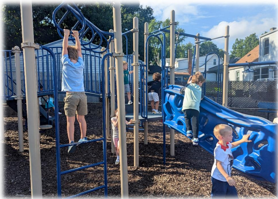
Having fun outside on the playground