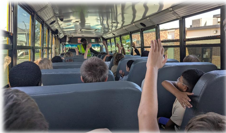
Sharing what we know about bus safety