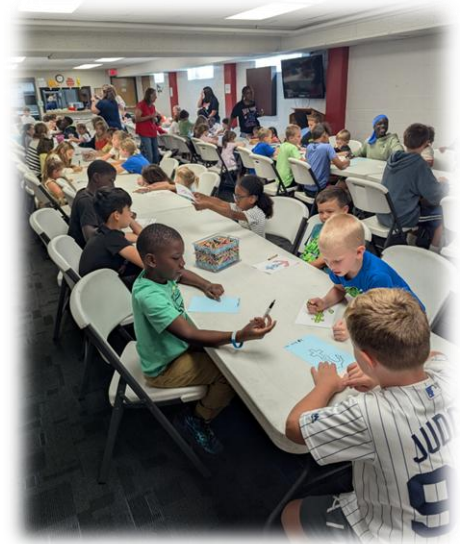
Chapel groups writing or drawing what it means to be "Anchored in Christ"