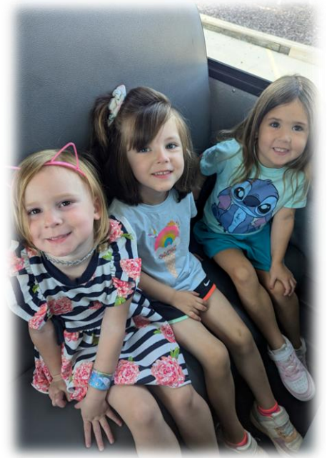
All smiles while learning about bus safety!