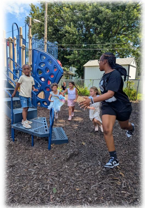
We love it when the big kids play tag with us!

September 1st- No School-Labor Day September 10th- Grandparents' Day ½ day of school September 17th- Goodnight Stories at 6:30 p.m.