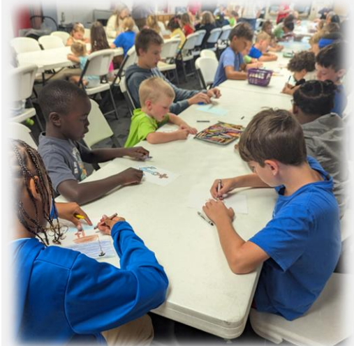
Coloring anchors with our chapel groups