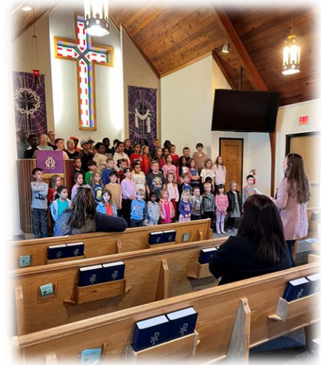
Practicing for Palm Sunday