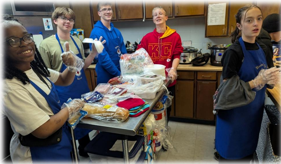
Future James Beard award-winners honoring their craft