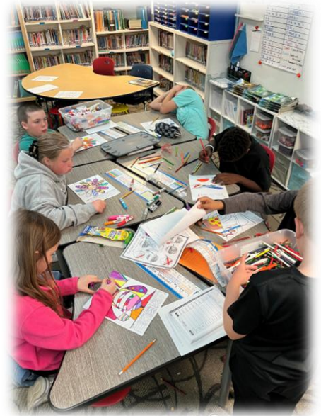
Coloring Easter pictures