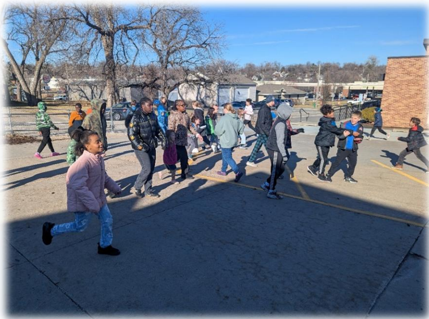
Switching sides for kickball