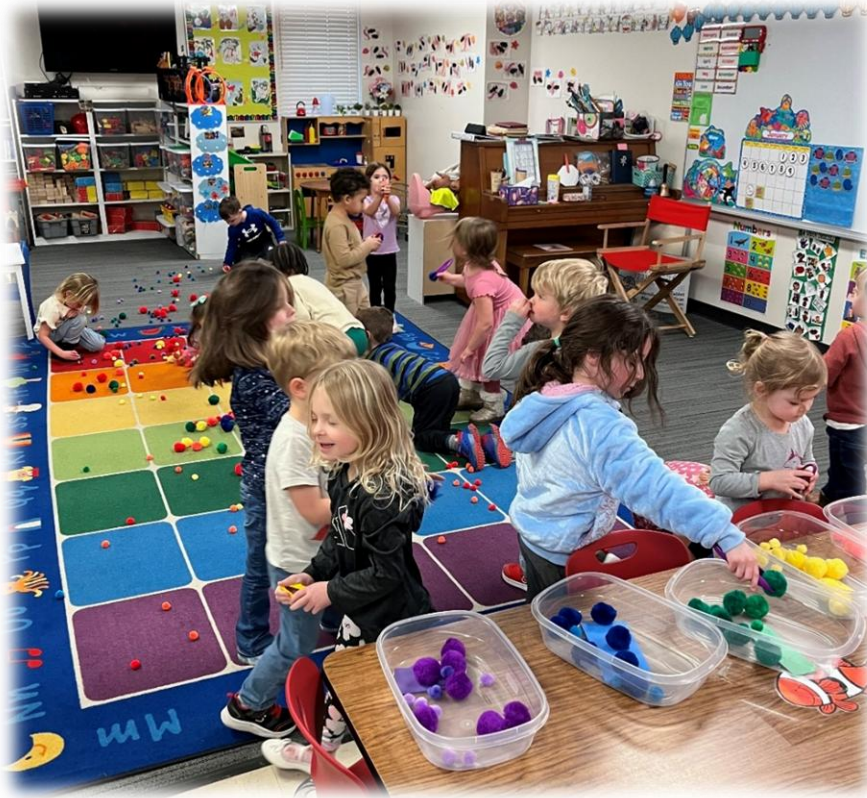
Fun with colorful puffballs!