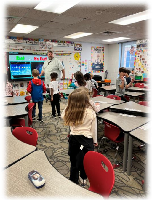
Marching to a "steady beat" in music class

February 6 th – Kindergarten show and tell