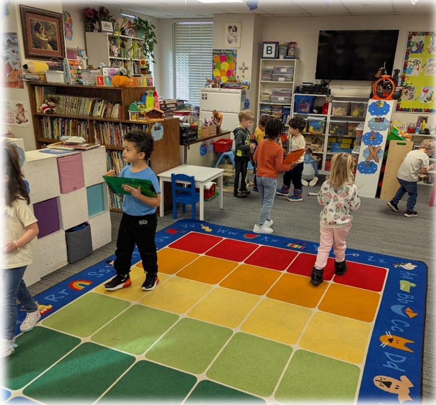
On a classroom color hunt