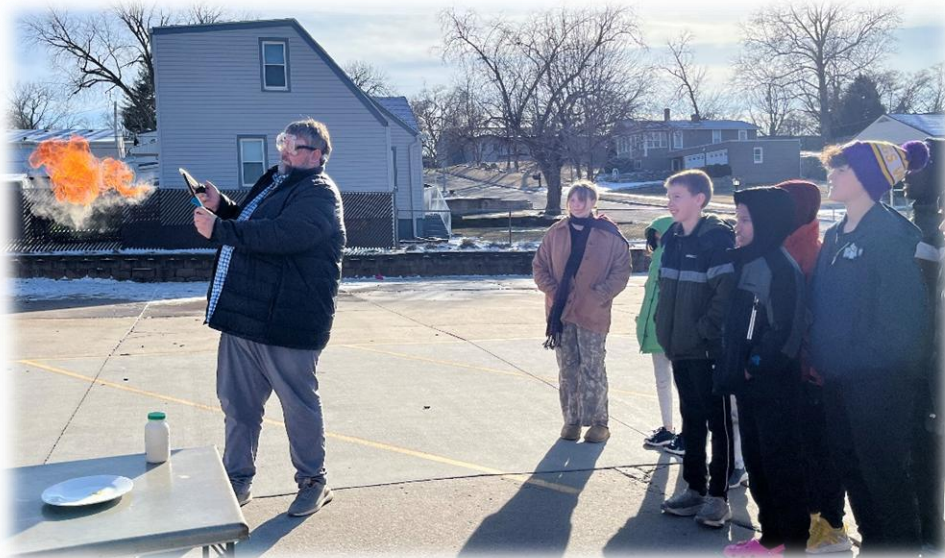
Learning about combustion reactions