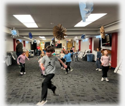
Indoor PE class on a frigid Fancy Friday