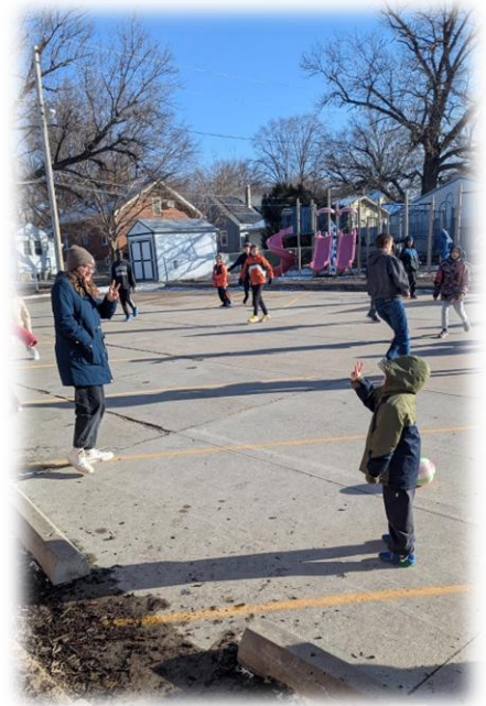
Enjoying the sunshine!