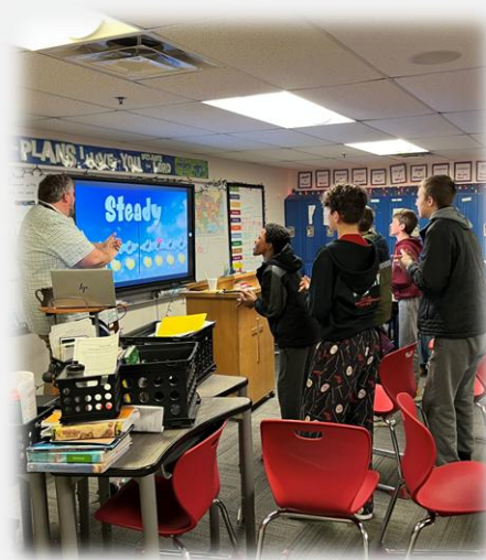
"Let's all keep... the steady beat! Stomp, stomp, pat, pat, clap, clap, pat, pat."

M – None Tu – None W – None Th – None F – None