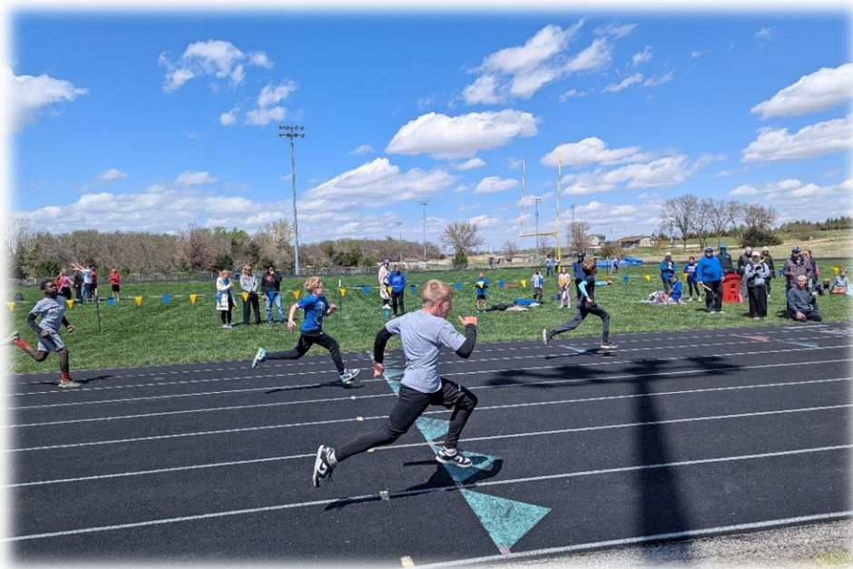
Speeding towards the finish line