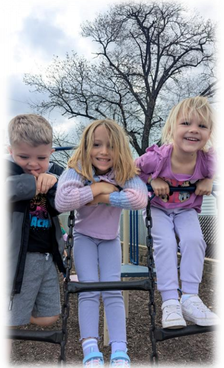
All smiles at recess!