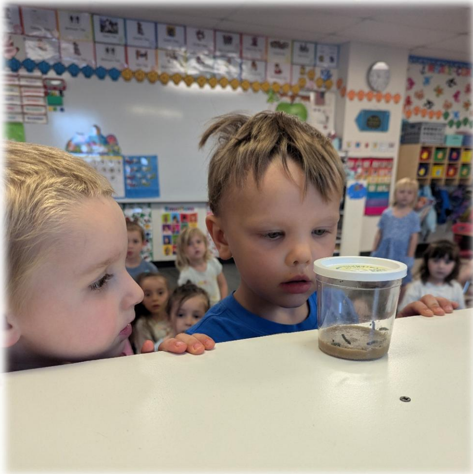
Taking turns getting an up-close look at the new classroom caterpillars!