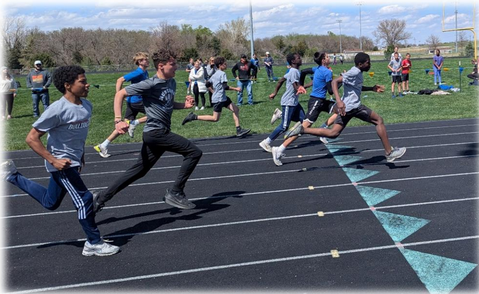
Headed for a photo finish in the 100M finals!