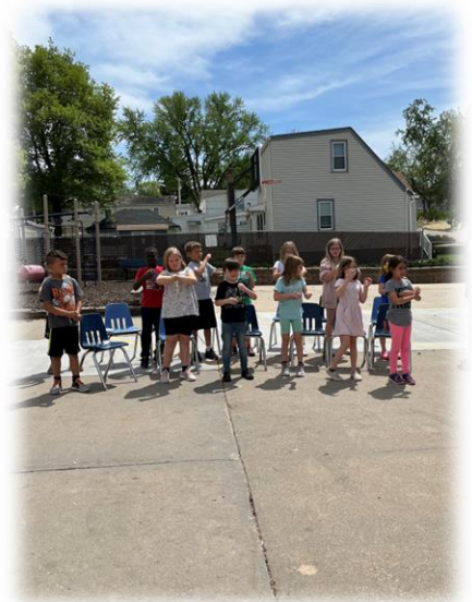
Musical practice outside!