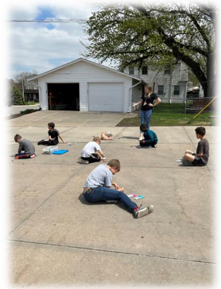
Mothers' Day art project