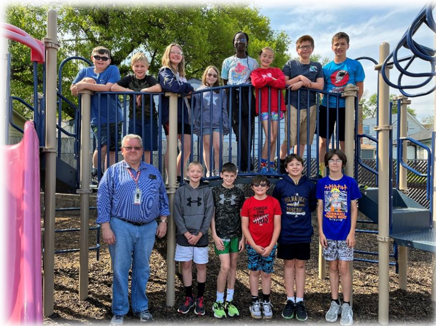
The 5 th & 6 th grade class of 2021-2022