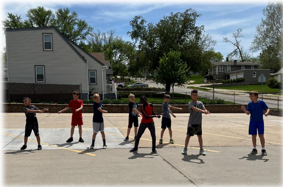
Practicing their dance moves for the musical!