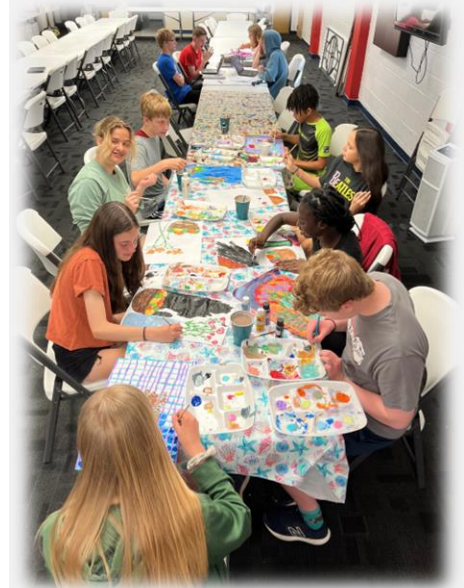
Impressionistic Art in 7 th & 8 th