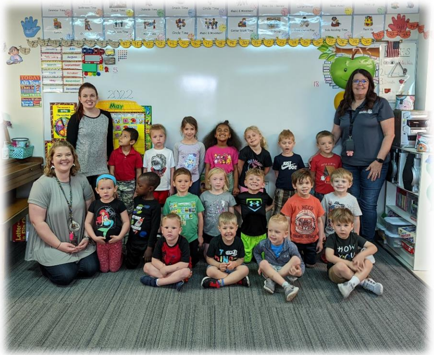
Checking out the butterflies hatching and a group picture of preschool