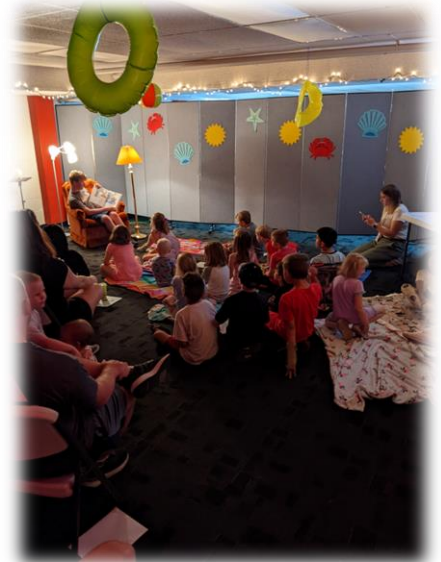
Goodnight Stories at Good Shepherd