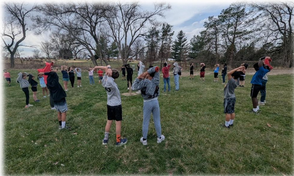
Stretching out before track practice #1!