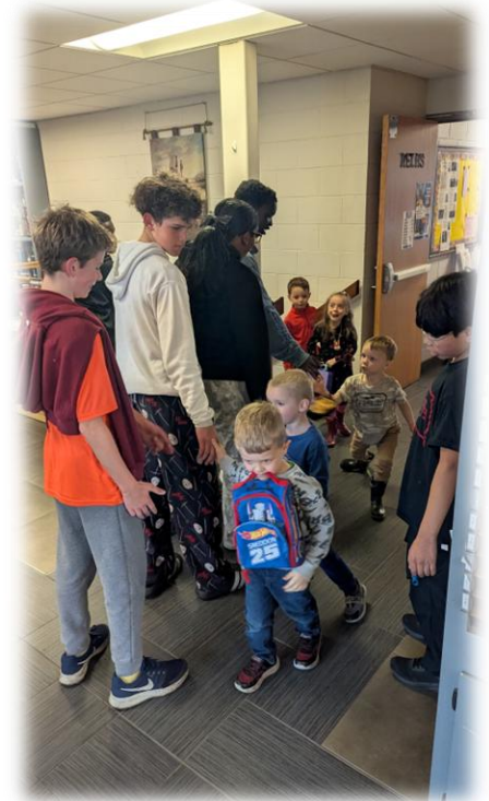
Impromptu high-five line after lunch