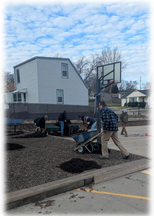
Helping spread our new playground mulch