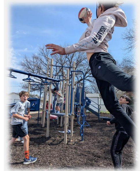
Intense 3-on-3 “Mud Ball”