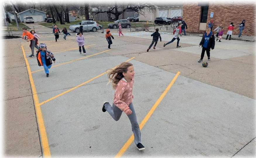
On the run in Color Tag