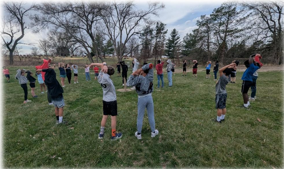
Stretching out before track practice #1!