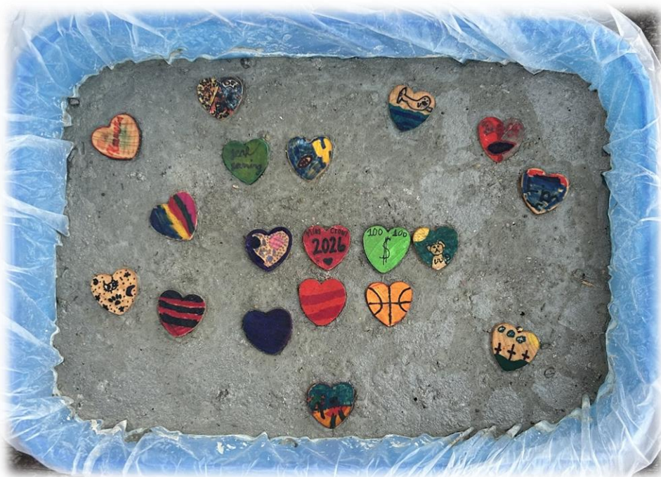
The 3 rd -5 th -grade stepping stone