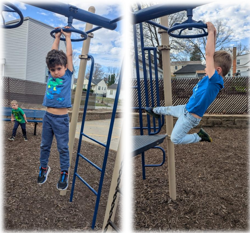
Hanging out on the playground!