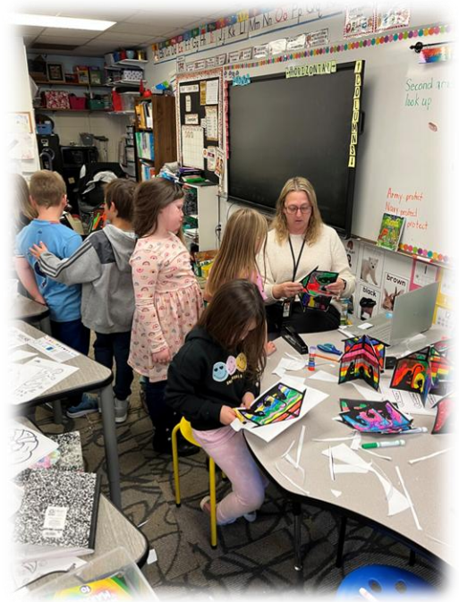
Making special Christmas manger mobiles

December 20 th – Christmas for Kids 9:00 a.m. – 12:00 p.m.