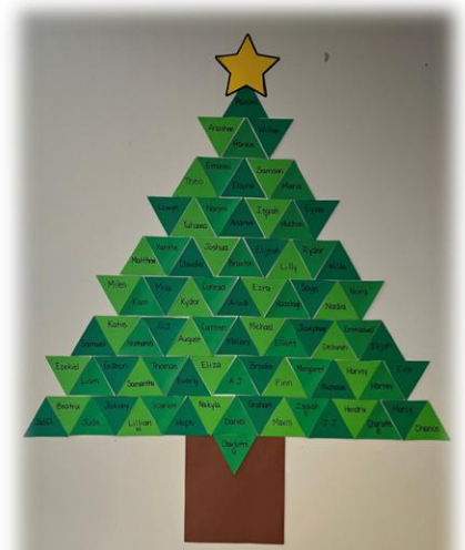
Our Good Shepherd family Christmas tree!