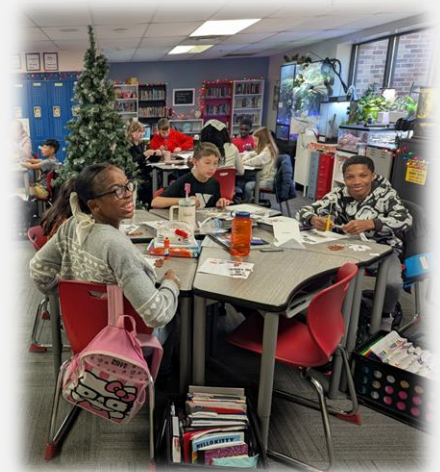
All smiles in 6th-8th grade!