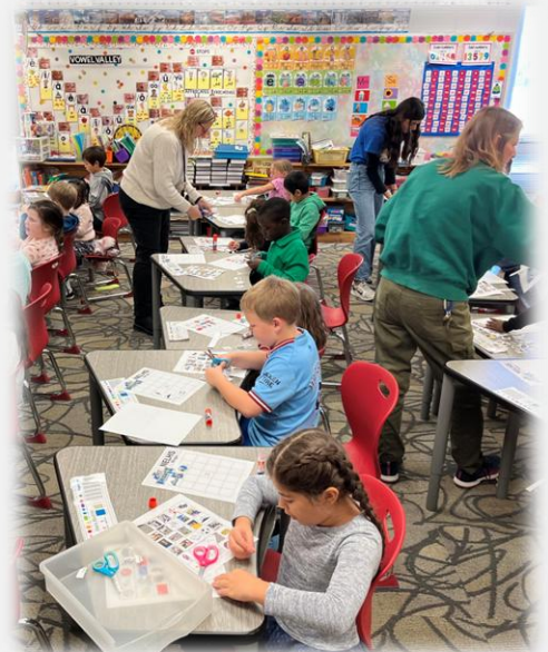
Creating their bingo cards

Memory Work will be Christmas Service recitations. A note was sent home last week. Please let me know if you do not have it.