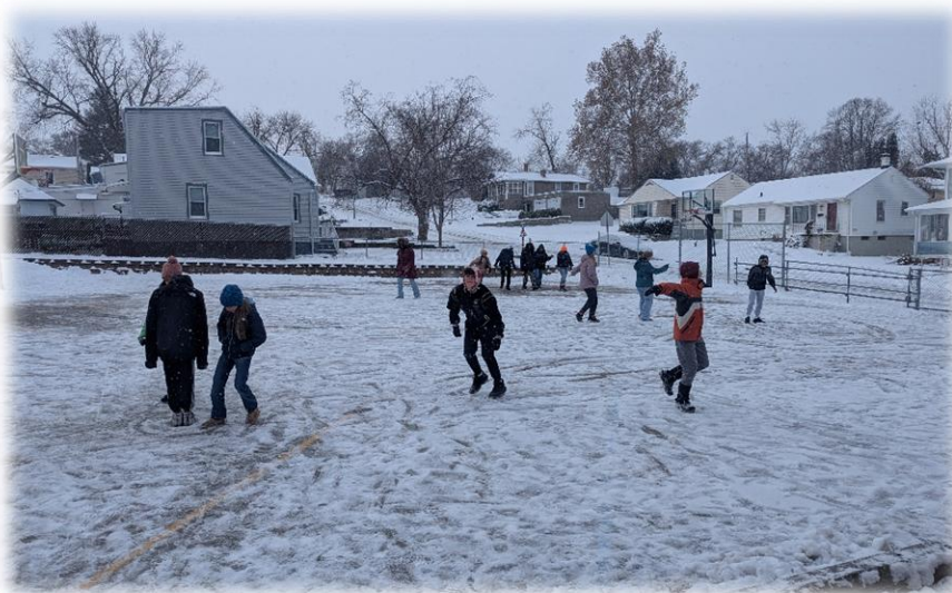
Playing in a Winter Wonderland