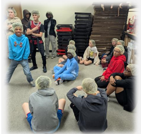
Hairnets in place and ready to tour Rotella's Bakery!