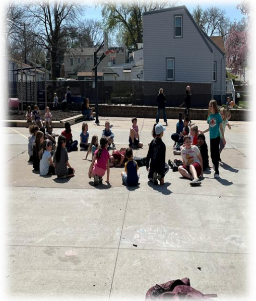
"Duck, Duck, Goose!"

April 29 th – Field Trip to the Rose Theater