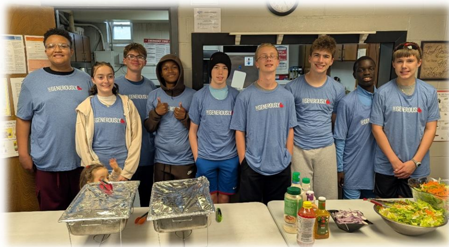
Reading to serve up some spaghetti and desserts!