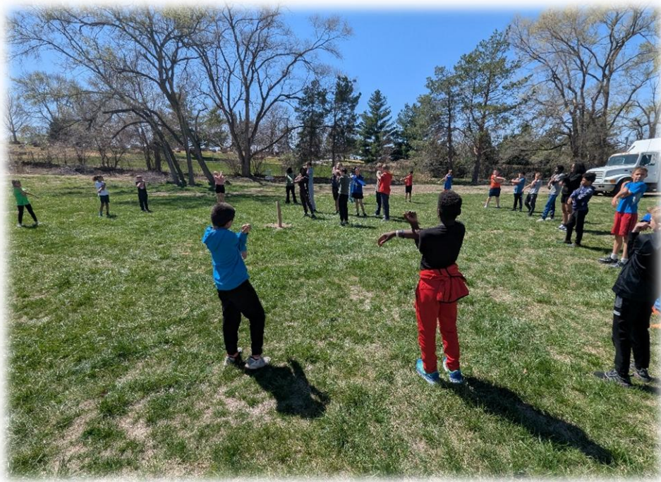
Stretching out before track practice