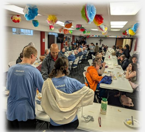
A great turnout at the spaghetti dinner