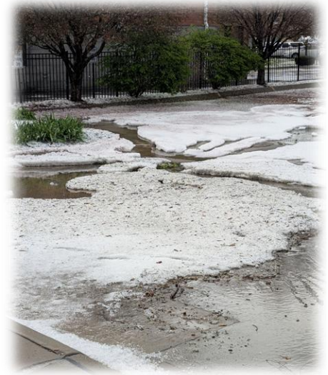
Rivers in the hail after Thursday's storm