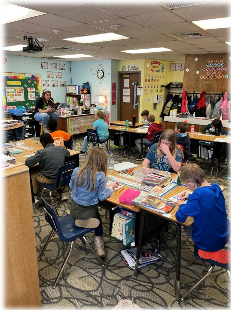
Read-aloud time in 3 rd & 4 th grade