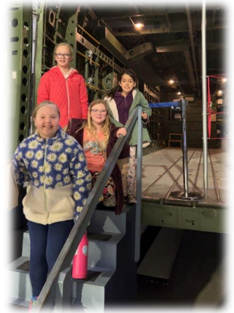
Checking out a cargo plane