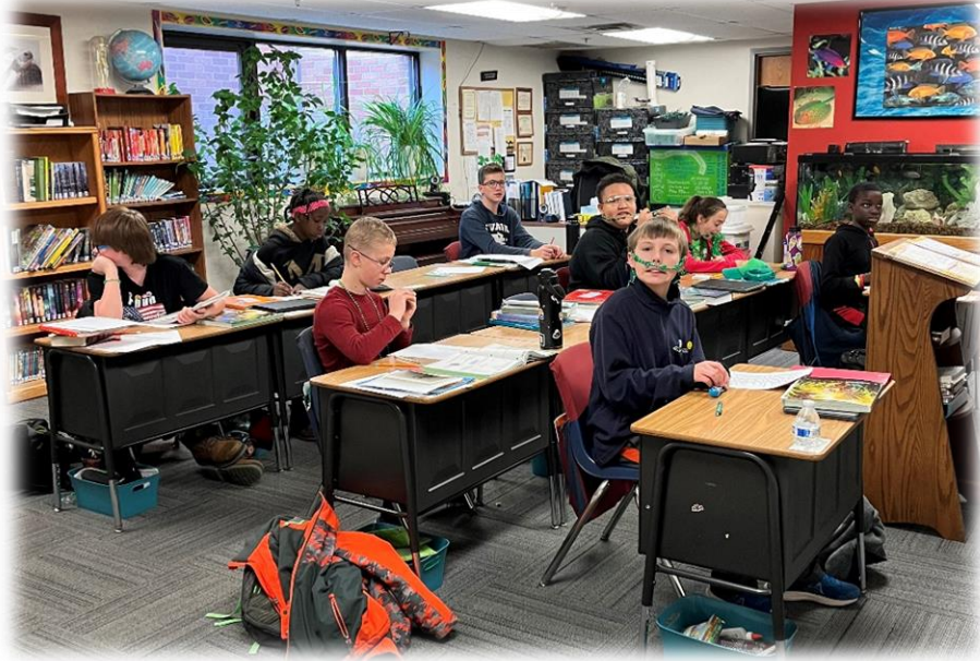
5 th & 6 th grade hard-at-work!