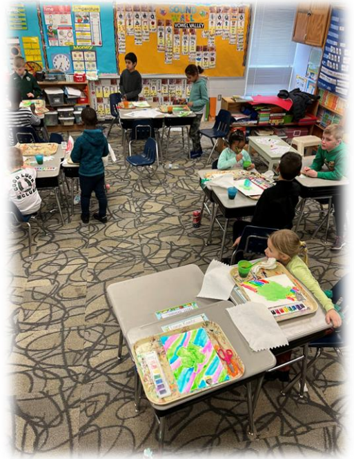
Art in the K-2 room