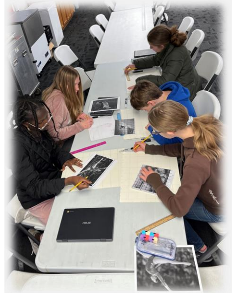
Creating wonderful art