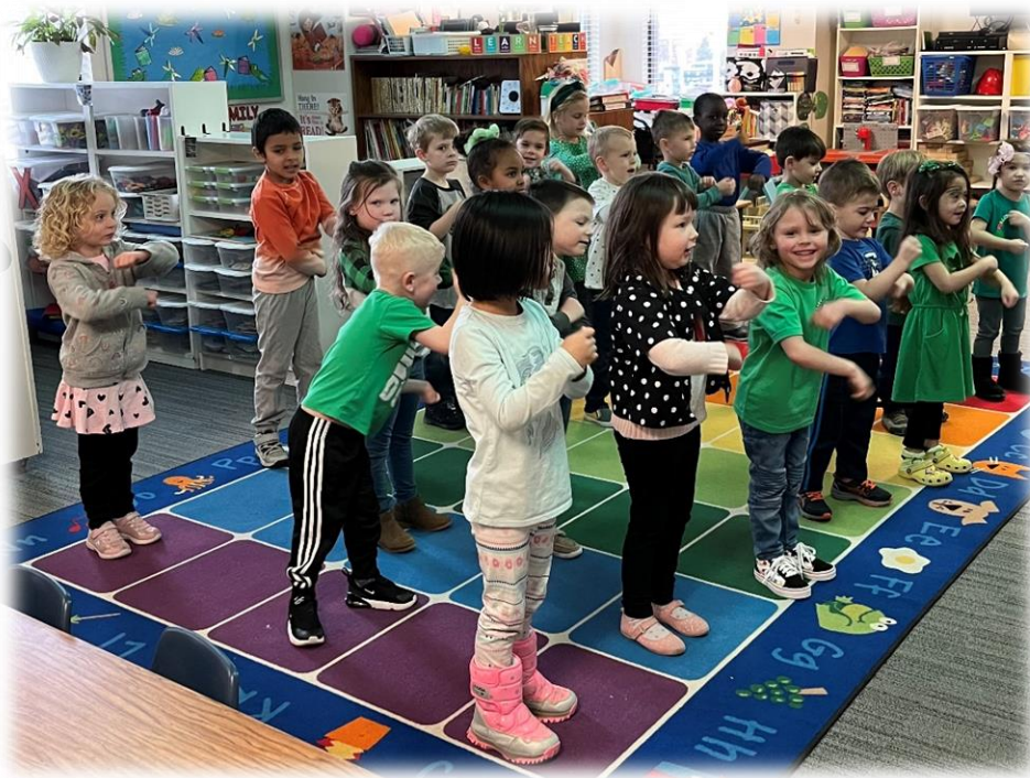
Having fun dancing in preschool!