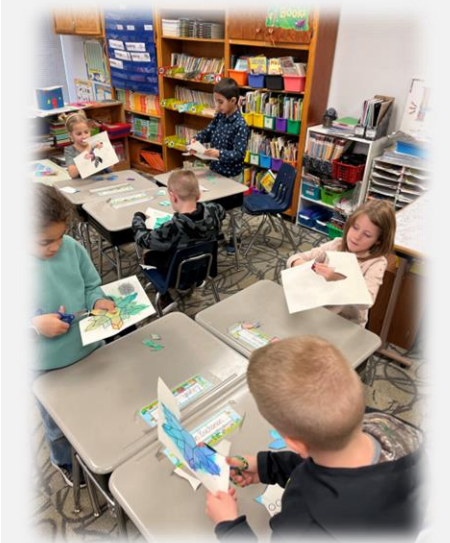
Working on art projects