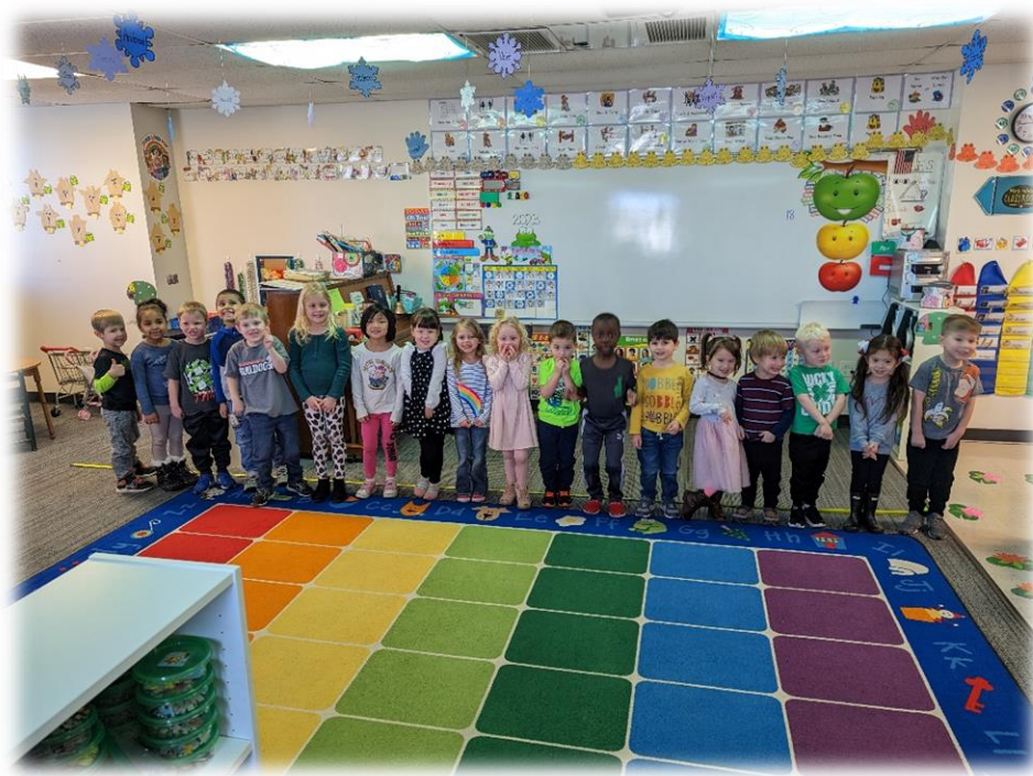
Seeing how many preschoolers it takes to measure a giant octopus!