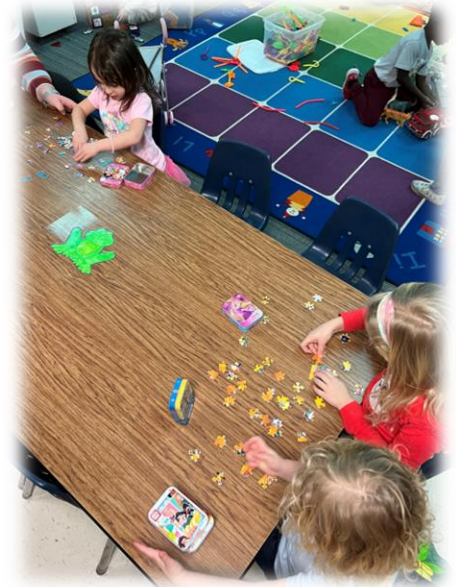
Working on some puzzles