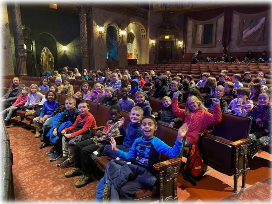
Excited for "The Lightning Thief" at the Rose Theater!

FED by the Word, FOLLOW Christ in his love, and FIND the lost with his Word.