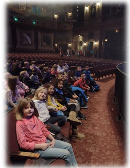
Front row for "The Lightning Thief"