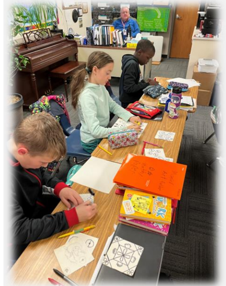
5 th & 6 th grade artists