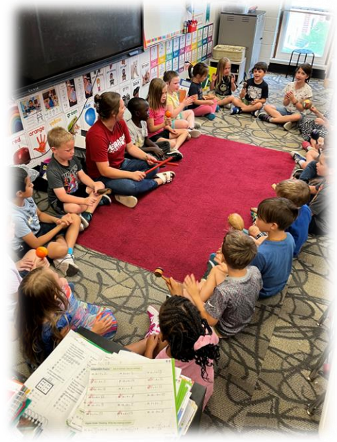
"Frog in the Meadow" rhythm practice!

September 6th- Grandfriends Day ½ day of school (no lunch or aftercare)