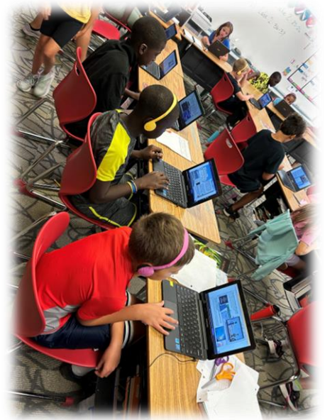
Computer skills class