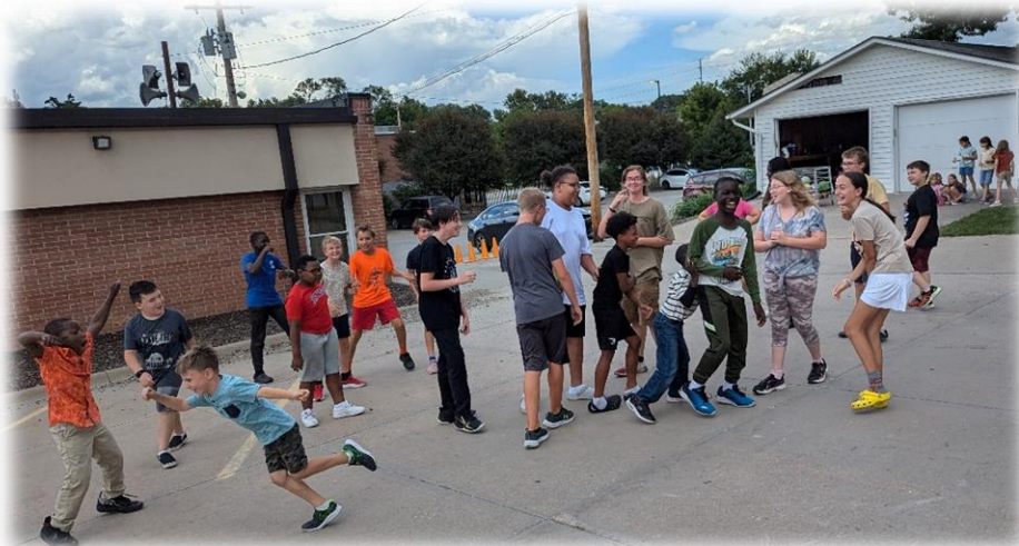
"Ninesquare" with loaded squares!