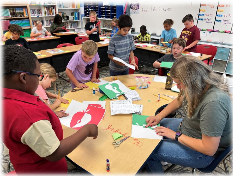
Artists at work