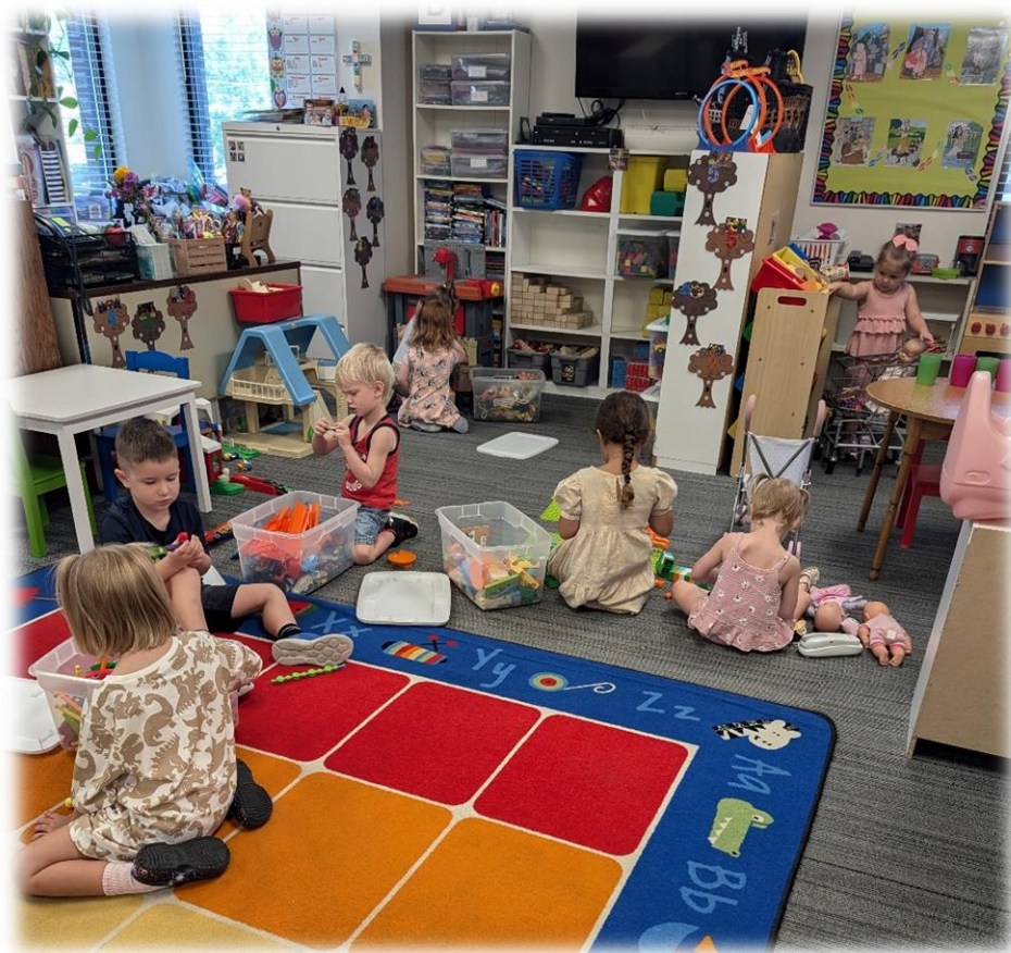
Fun during free-play time!