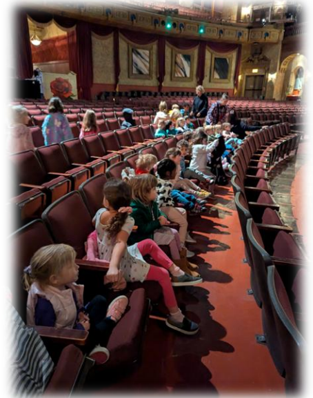
Taking our seats at the Rose Theater