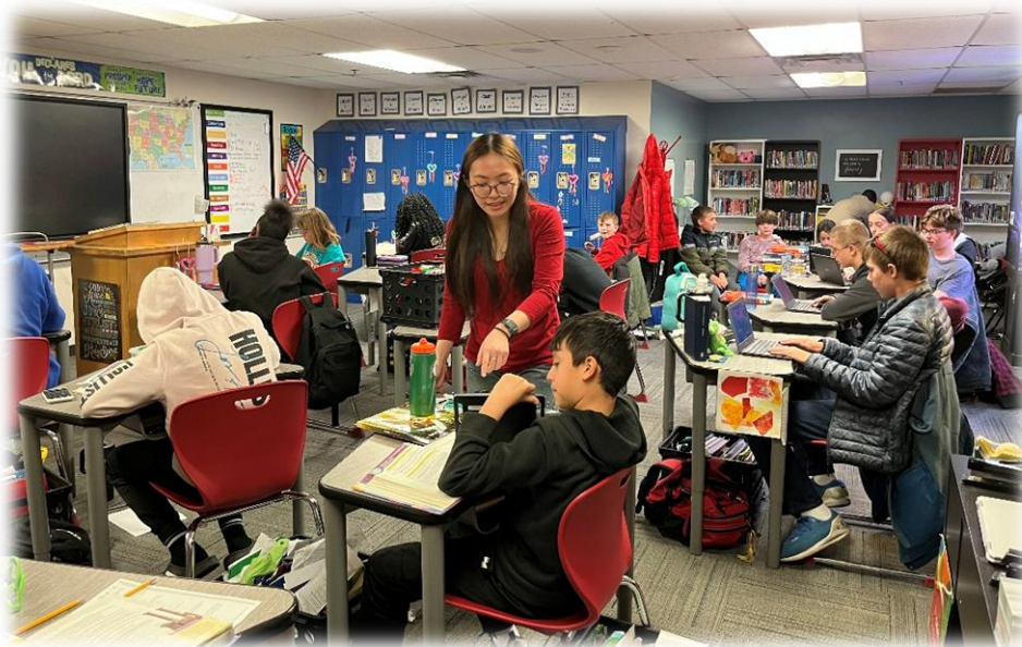
Miss Lily teaching a 6 th -grade language lesson