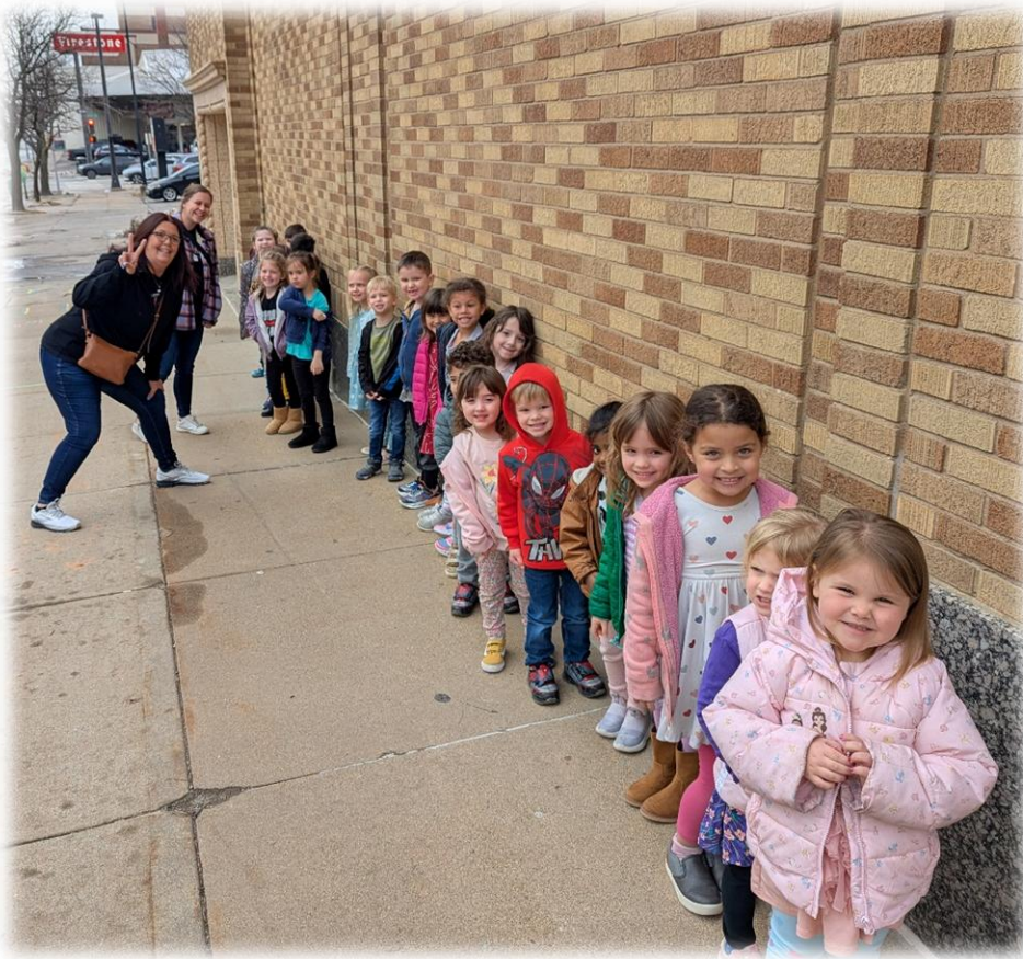
Ready to go in and see the play!