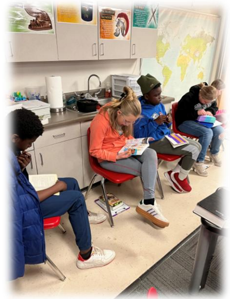
5th-graders visiting the 6th-8th grade classroom on Friday