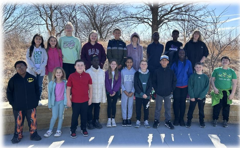
3rd-5th grade at Lauritzen Gardens