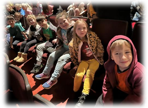
Kindergarteners ready for the play!

April 13 th – Palm Sunday – First Grade Bibles during the 10:30 a.m. service – Preschool – 8 th grade sing during the 10:30 a.m. service